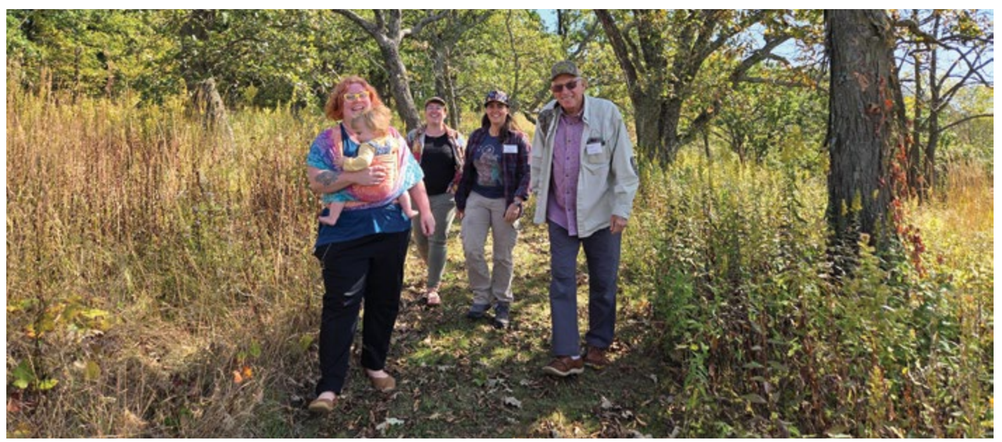
DALC board and staff members visit the Glass property, one of

From our humble beginnings at the Jordahl Farm to our role today as a trusted leader in conservation, none of this work would be possible without your dedicated support. As we celebrate our 25th anniversary, we're confident that our work to inspire communities, safeguard vital habitats, and protect the natural beauty of the Driftless Area will endure for generations to come... because of you!