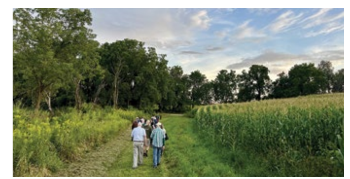
Participants at one of the Lowery Creek Watershed Initiative's Evenings Afield events learn about sustainable farming in the area.

First, American Transmission Company proposed the Cardinal Hickory Creek transmission line, to be routed through the heart of our service area, threatening several conservation easements. Local citizens quickly organized a grassroots opposition campaign, while DALC mounted the legal challenge with the Environmental Law & Policy Center. We have been coordinating this effective collaboration for eight years. Although the transmission is now built and operational, the crossing through the Mississippi River National Fish & Wildlife Refuge has been ruled to be illegal, and is still in court.