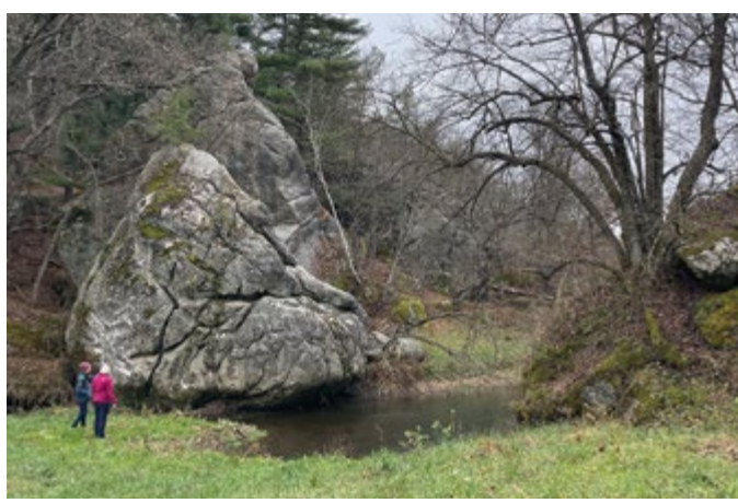
One of the massive boulders at Big Rock, framed by pine relict behind and trout stream in front.

The phenomenal plant life at Big Rock is there in part because of the amazing variety of habitat on the 140-acre property. It's primarily wooded, including a large pine relict – a rare ecosystem left over from the Ice Age, featuring species usually found much further north. The pine relict was sheltered from historic fire regimes by abundant large boulders, which also lend their name to the Big Rock Branch of the Blue River, winding through the property for about 3/4 of a mile. In addition to the rich woodlands and trout stream, this parcel includes 38 acres of grassland that are enrolled in the Conservation Reserve Program, further boosting the diversity of plants, insects, and other wildlife.