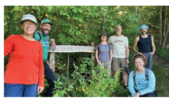
A volunteer crew working on the Driftless Trail poses with the sign to the Welsh Hills Trail.

At the same time, a 15-year partnership of 18 agencies and organizations focused on the grassland region in