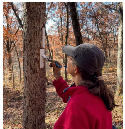
Clockwise: Hikers on the Weaver Road Trail; the trail's Leopold-style benches; and putting finishing touches on trail markers.