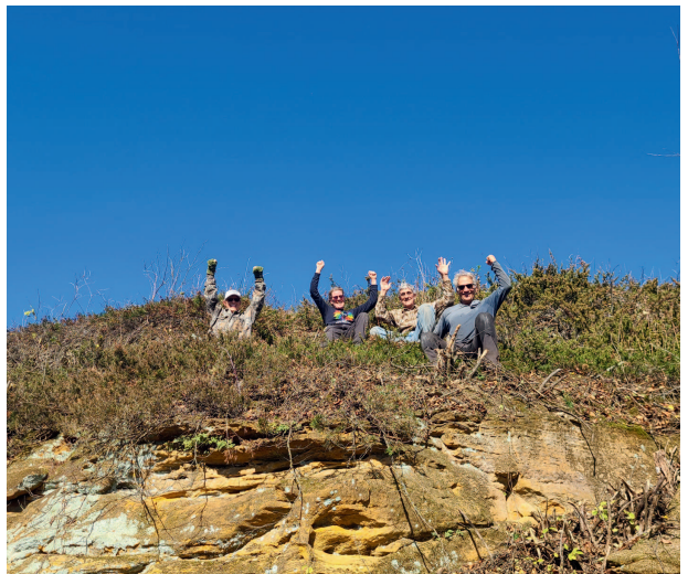
Left: Volunteers work on a 32-foot A-truss bridge across a stream on the Driftless Trail. Right: Volunteers at Wild Oaks Preserve (formerly Spring Valley Tract) celebrate connecting two brush-clearing units.